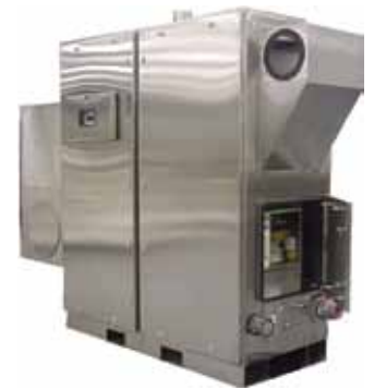
Offshore Hazardous Area