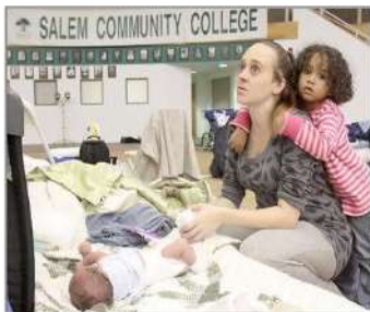
Family at Davidow Hall Red Cross Shelter during Hurricane Sandy.